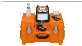
Carrying case with worktable CC-82

*X=2(USA), 3(EU), 4(JP), 5(UK/HK), 8(CHINA), 9(INDIA), 10(BRAZIL) Items listed in Basic Accessories are always included with the splicer body. Overall kit content may vary regionally. Please check with your local authorised reseller to confirm kit content in your region.