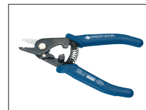
Jacket remover JR-M03