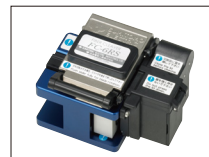
Table-top cleaver FC-6 / FC-6R series