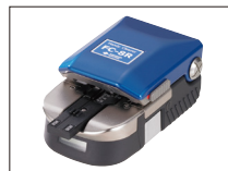
Handy cleaver FC-8R series