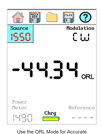
Optical Return Loss Measurements to -55dB