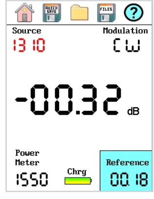
Easy Operation with Color Touch Screen