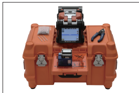
Carrying case with worktable CC-81